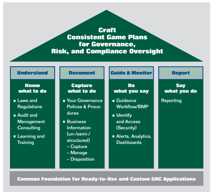
Figure 2: Four Steps Toward Managing Governance, Risk, and Compliance

Each of these types of compliance has its distinguishing features, but it turns out that at a tactical level, compliance requirements in each of these categories can be satisfied through the four common steps shown in Figure 2.